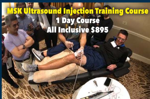
MSK Ultrasound Injection Training Course 1 Day Course All Inclusive $895

August 6, 2020: San Diego, CA August 20, 2020: Nashville, TN