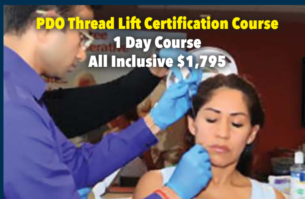
PDO Thread Lift Certification Course 1 Day Course All Inclusive $1,795

August 6-7, 2020 – San Diego CA and Virtual Live Stream August 20-21, 2020 – Nashville TN and Virtual Live Stream