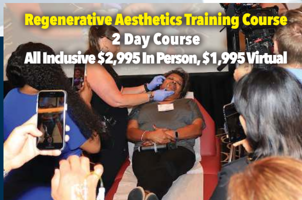
Regenerative Aesthetics Training Course 2 Day Course All Inclusive $2,995 In Person, $1,995 Virtual

August 7-8, 2020: San Diego, CA August 21-22, 2020: Nashville, TN