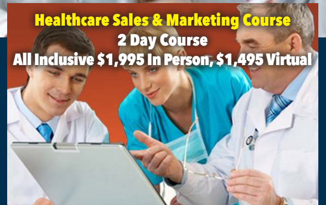
Healthcare Sales & Marketing Course 2 Day Course All Inclusive $1,995 In Person, $1,495 Virtual

August 7-8, 2020: San Diego, CA August 21-22, 2020: Nashville, TN